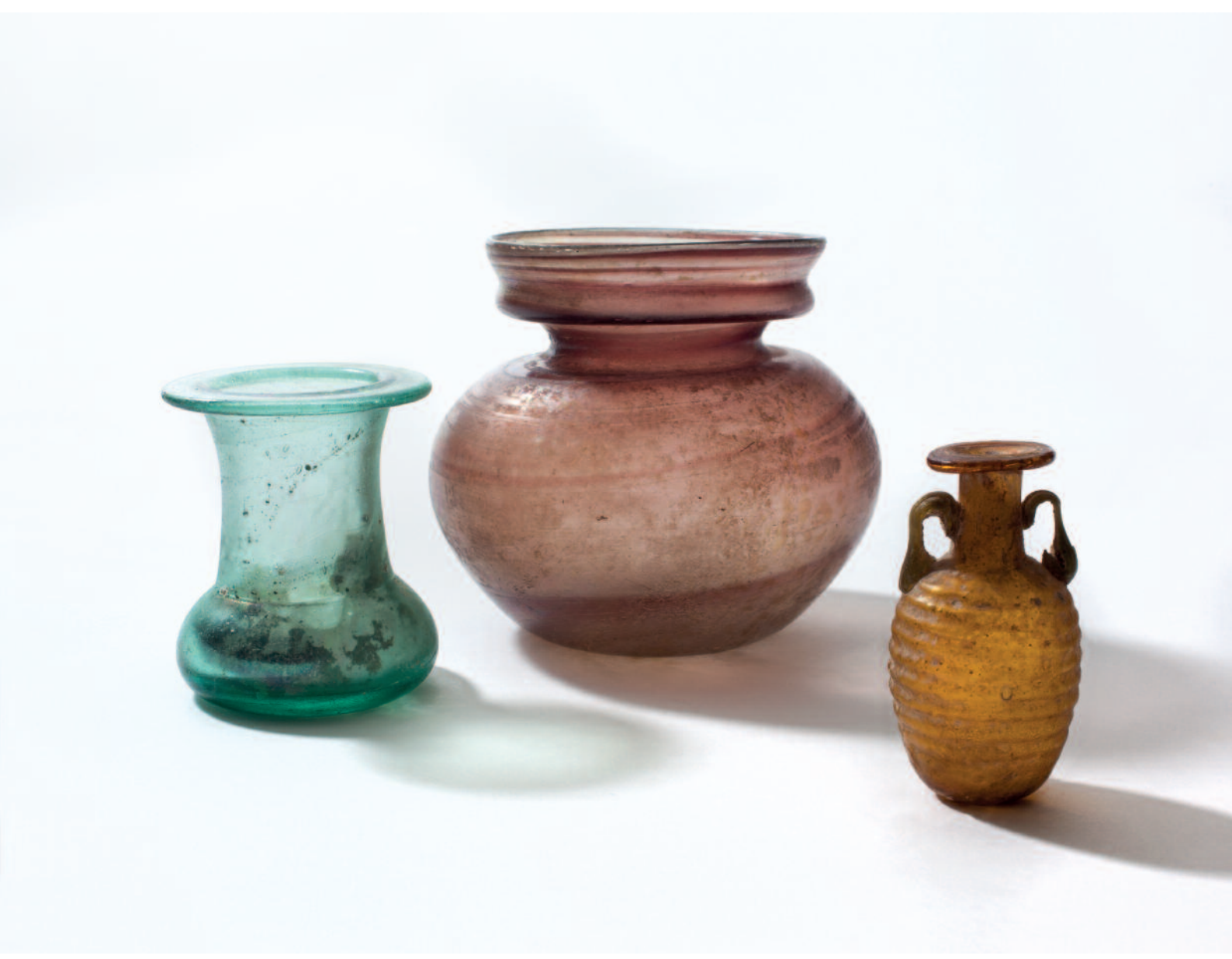
66 67 68