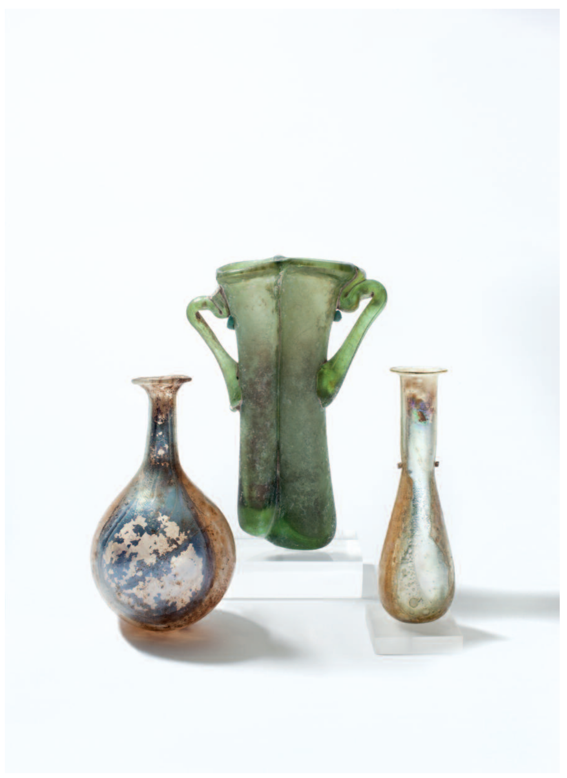
63 64 65