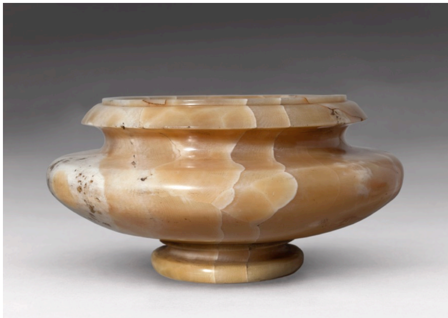
Romano-Egyptian footed bowl, 1 st -3 rd Century AD, Alabaster, H-18cm, D-37.5cm

An arresting Romano-Egyptian alabaster footed bowl of monumental form was exhibited at the Brooklyn Museum in 1941 and was sold from the well-known Brummer collection, at Sotheby's London in 1964. The bowl was made using a lathe and then polished to a smooth sheen with abrasives and water.